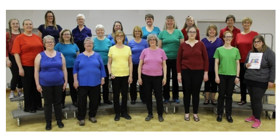
We held an A-Cappella Boot Camp from April 9 to May 29 and had 5 attendees. As part of the Boot Camp program, we performed at Extendicare in Cobourg with our Boot Camp participants and a Seniors Club in Roseneath.