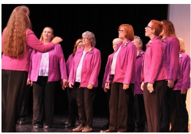
During the month of May we were the guest performers at 3M Dance Works Annual Dance Recital and at the Colborne Apple Blossom Festival

In June, Northumberland Chorus excitedly participated with 3 quartets/VLQs at the Komedy Kwartet Night. We felt very proud about that, considering we are such a small chorus. We all had a lot of fun putting these numbers together.