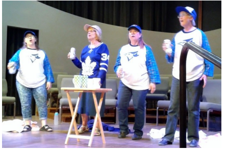
Desperate Housewives of Northumberland performed their version of Take Us Out to the Ball Game.