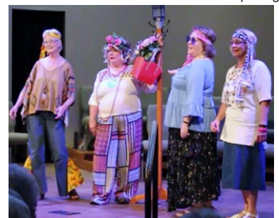
Four Easy Peaces performed Feelin Groovy.

In June, Northumberland Chorus excitedly participated with 3 quartets/VLQs at the Komedy Kwartet Night. We felt very proud about that, considering we are such a small chorus. We all had a lot of fun putting these numbers together.